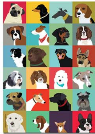
PUP001 Tea Towel The Usual Suspects MOQ x 6 (Bespoke x 50)