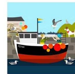
LDG100 Greeting Card Landing The Catch MOQ x 12 (Bespoke x 100)