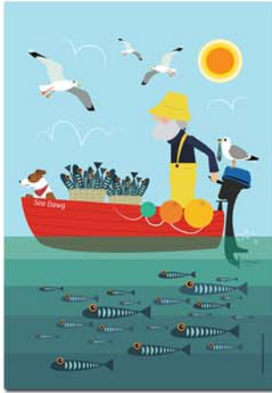
SDG001 Tea Towel Sea Dawg MOQ x 6 (Bespoke x 50)