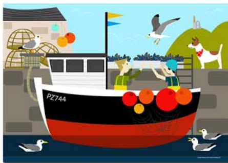
LDG001B Tea Towel Landing The Catch MOQ x 6 (Bespoke x 50)