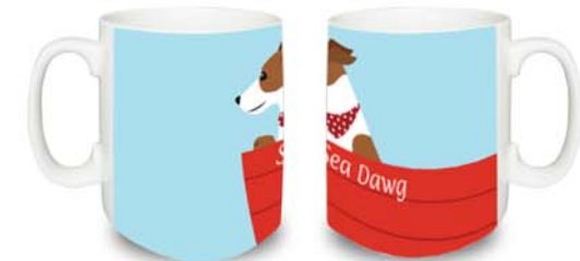
SDG003A Ceramic Mug Wilf MOQ x 6 (Bespoke x 48)