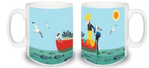
SDG003 Ceramic Mug Sea Dawg MOQ x 6 (Bespoke x 48)