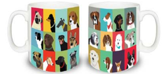
PUP003 Ceramic Mug The Usual Suspects MOQ x 6 (Bespoke x 48)