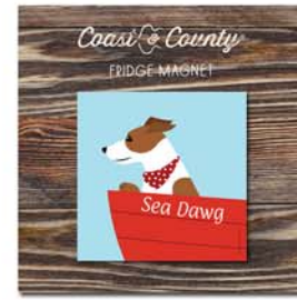
SDG005 Fridge Magnet Wilf MOQ x 12 (Bespoke x 100)