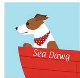
SDG101 Greeting Card Wilf MOQ x 12 (Bespoke x 100)