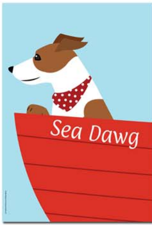
SDG001A Tea Towel Wilf MOQ x 6 (Bespoke x 50)