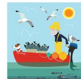
SDG100 Greeting Card Sea Dawg MOQ x 12 (Bespoke x 100)